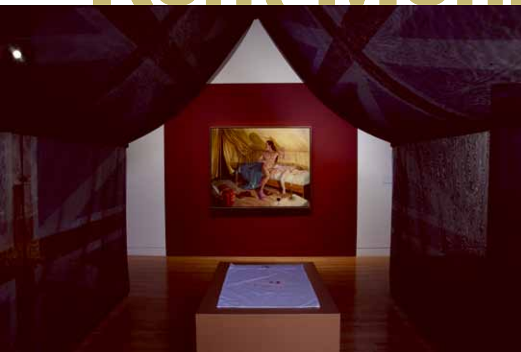
The Night of September 12, 1759 , 2011 2 acrylics on canvas, 2 painted screens, rhinestones, wooden dowels, 2 pillow- cases with embroidered monogram and monotype print, sound Variable dimensions Anonymous gift in honour of W. Bruce C. Bailey Collection of the Musée d'art contemporain de Montréal