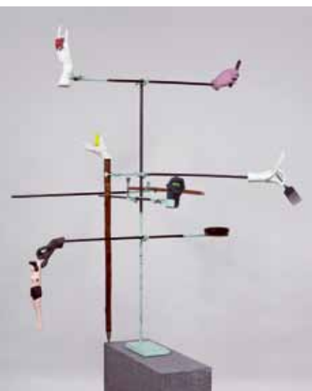
Cargo-culte , 2011 Metal stand and wooden objects, rattan, metal, plastic and ceramic, Hydrocal FRG plaster, acrylic, enamel paint 154.5 × 122 × 127 cm Collection of the Musée d'art contemporain de Montréal

The exhibition, which contains approximately thirty works, is accompanied by a major publication that includes essays by the curator, Lesley Johnstone, and by feminist art historian Amelia Jones, as well as an interview with the artist by Wayne Baerwaldt. It is Blass's largest exhibition to date, following her participation in the inaugural Québec Triennial at the Musée d'art contemporain de Montréal in 2008 and numerous group and solo exhibitions in Montréal and across Canada. Lesley Johnstone, Curator