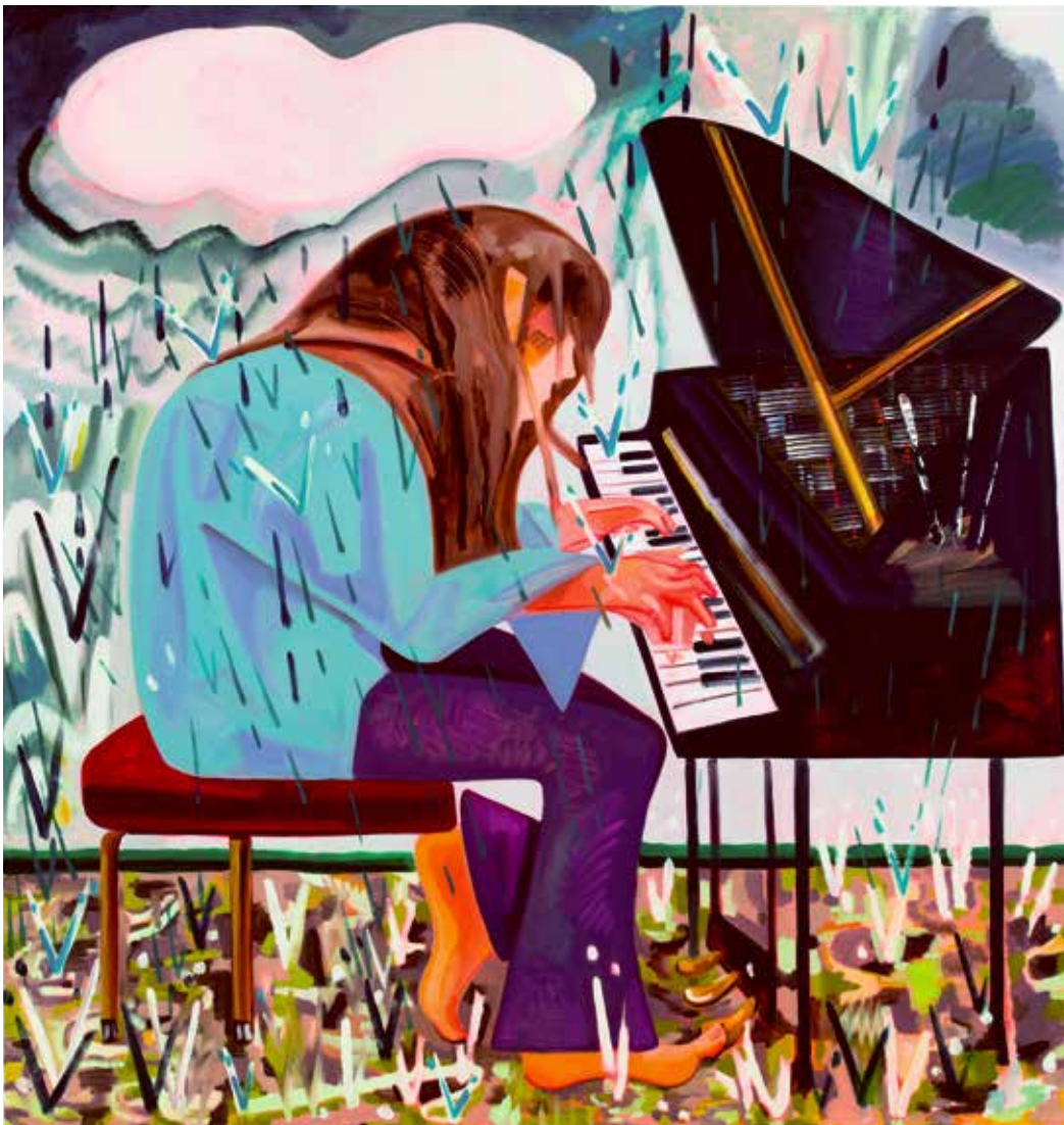
Piano in the Rain , 2012 Oil on canvas 223.5 x 213.4 cm Private collection, New York