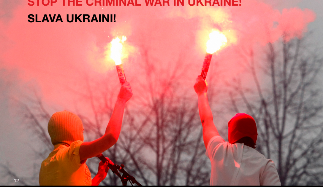
The exhibition Velvet Terrorism: Pussy Riot's Russia is organized and circulated by Kling & Bang, Reykjavik.

FREE THE THOUSANDS OF POLITICAL PRISONERS! STOP THE CRIMINAL WAR IN UKRAINE! SLAVA UKRAINI!